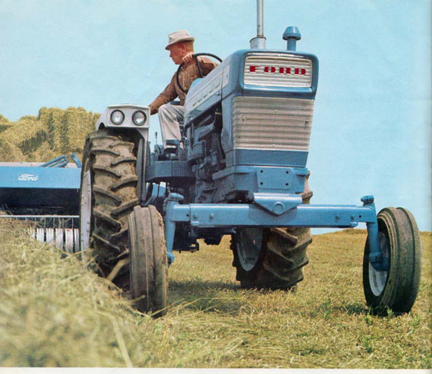
Ruggedness shows in every detail of the Ford 5000 row-crop. Optional wide front axle is built with the strength to handle heavy mounted implements—offers 2-foot under-axle clearance for row crops.