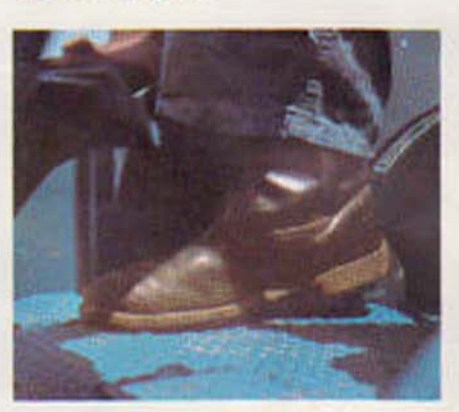
Diff-lock is standard on Ford 5000. Push down with your heel, use full traction of both drive wheels when going is slippery. Lock disengages automatically.