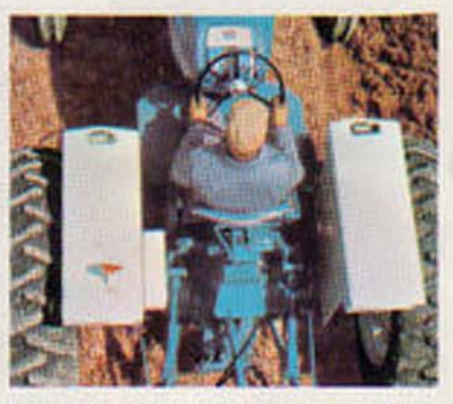
You sit high, out of the dust and with an excellent work view. One more reason you'll do a better job of farming on a Ford 5000 row-crop.