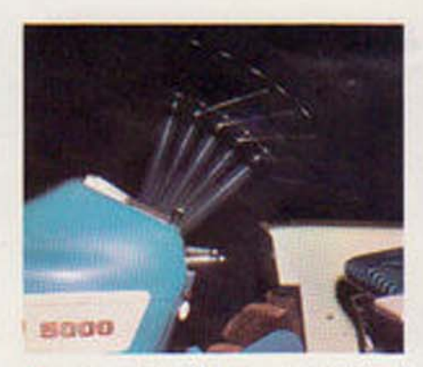
Steering wheel locks in any of 5 positions—fits you whether you sit or stand. Hydrostatic power steering takes the work out of turns.