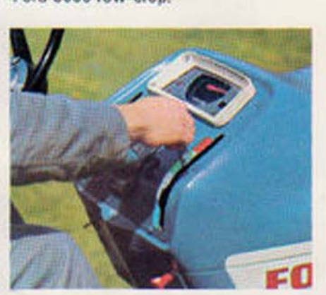
Ford's exclusive 10-speed power-shift transmission (optional) combines unsurpassed on-the-go control with efficient all-gear drive.