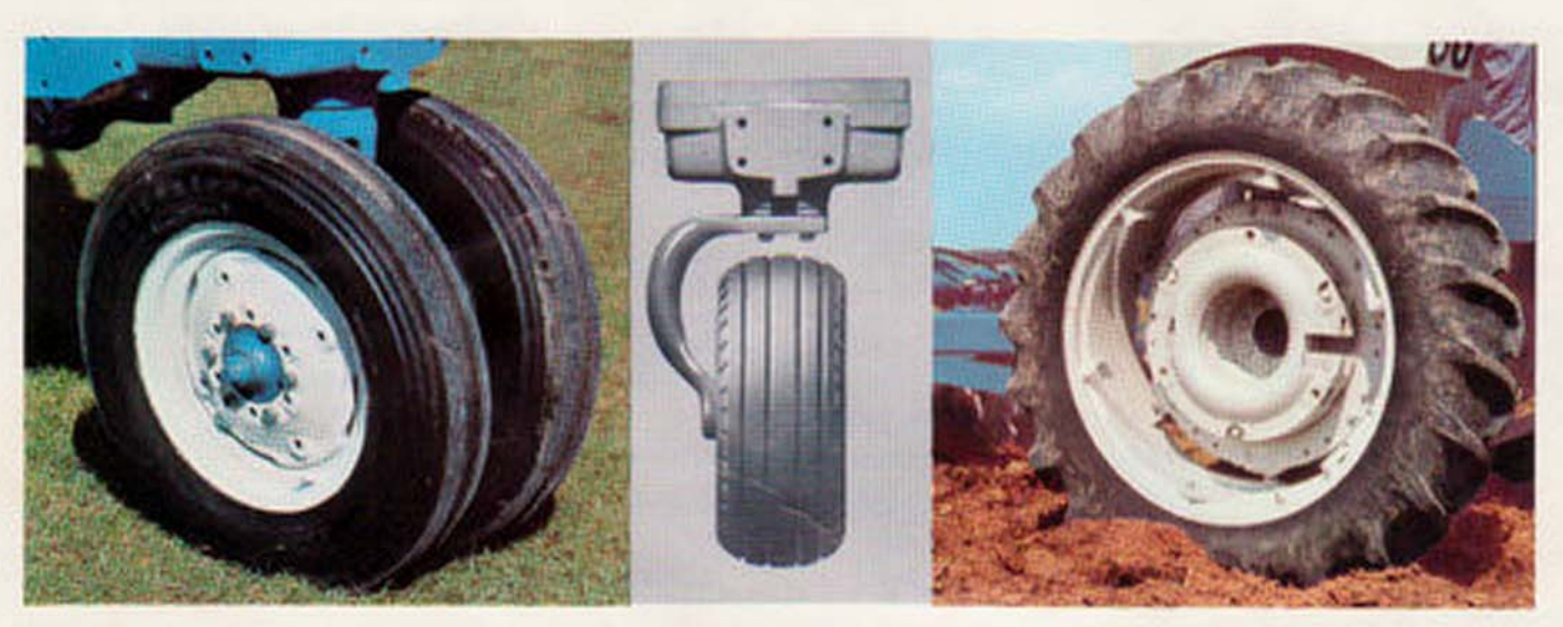
Prefer a tricycle-type tractor for use with mounted cornpickers or cultivating? Then order your 5000 with dual front wheels. Or get it with the single front wheel (center).