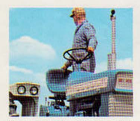
Push the seat back, raise the steering wheel to suit your height. You enjoy comfortable standing room to spare on this big, flat operator's deck.

Start the engine; give the 5000 a tryout. You'll find steering accurate and as near effortless as on any tractor you've driven. Multiple-disc brakes are smooth and easy. Hydraulics, quick and precise in response. After you work the Ford 5000 a day, you'll agree. This is a farmer's tractor. A tractor driver's tractor. Your kind of tractor.